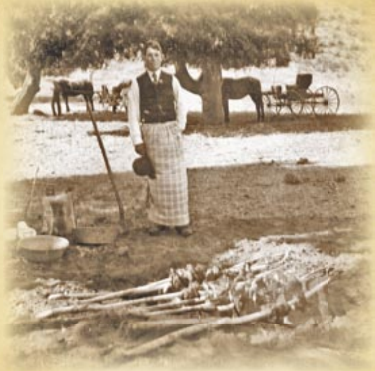
■ The old-fashioned way to barbecue, with beef skewered on green willow poles over an earthen pit of red oak coals.

Today, Santa Maria Style Barbecue is enjoyed across the region at restaurants, events and celebrations, providing a perfect complement to the wines, strawberries and other locally grown flavors of the Santa Maria Valley. Indeed, no visit to the region is complete without a taste of what Sunset magazine once called “the best barbecue in the world.”